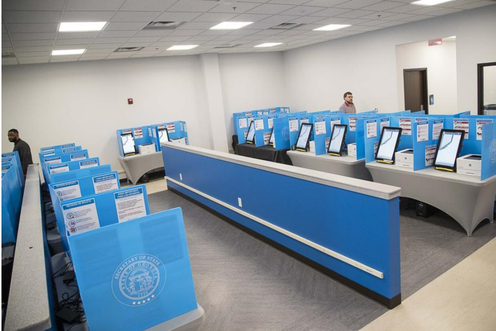
Figure 4. Gwinnett Elections Office Polling Place

403. Figure 5 is a true and correct photograph taken by an Atlanta Journal Constitution photographer of the inside of the Cartersville polling place, in Cartersville, Georgia, taken in early voting in October 2019, during the November 2019 election.