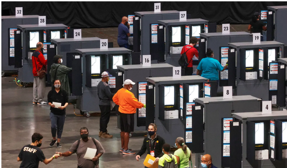
People cast their ballots during early voting for the presidential elections at State Farm Arena in Atlanta, Ga., October 12, 2020.

404. Figure 6 is a true and correct photograph of the inside of the State Farm Arena polling place in Fulton County, Georgia, taken in October 2020, during early voting for the General Election.