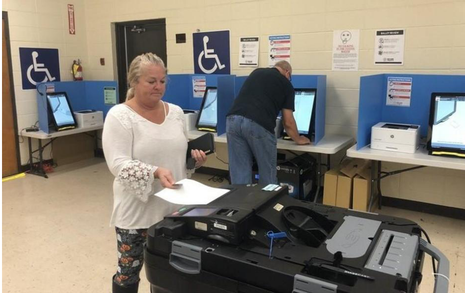
Figure 5. Cartersville, Georgia Polling Place

404. Figure 6 is a true and correct photograph of the inside of the State Farm Arena polling place in Fulton County, Georgia, taken in October 2020, during early voting for the General Election.